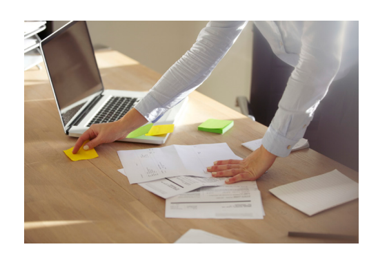
We will expedite all required paperwork!