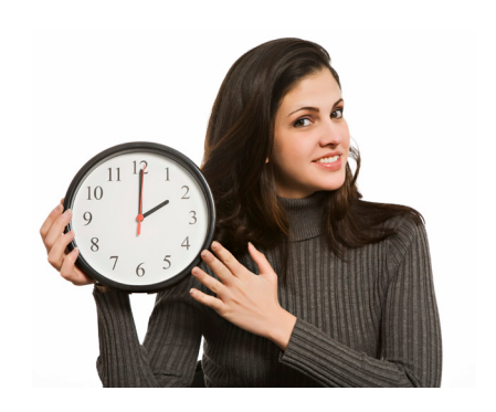
We get the work done when you need it!